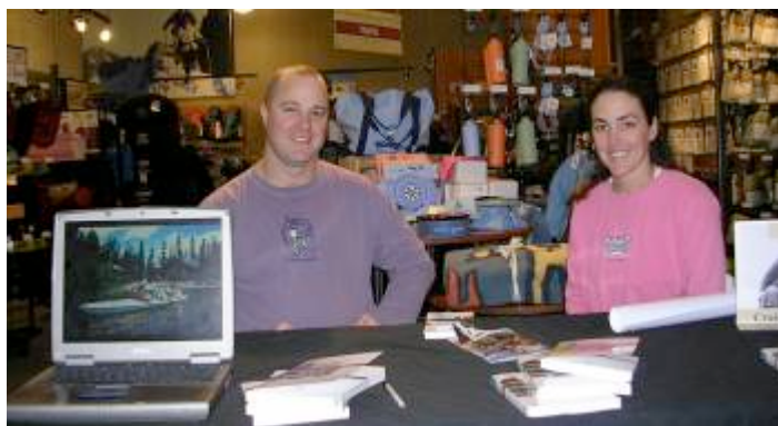
Photos from REI Book signing tour in December

Access Anything was also been accepted to the Midwest Book Review in November and will appear on their website through 2007.